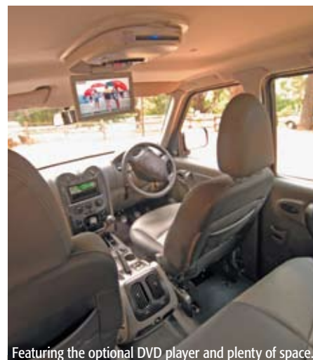
Featuring the optional DVD player and plenty of space.