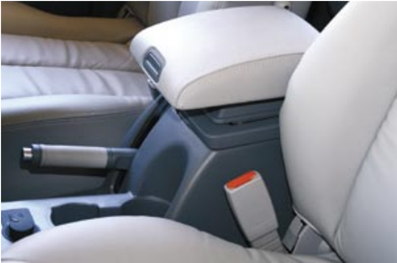
A small knob on the centre console allows you to switch from two wheel drive high into four wheel drive at the drop of a hat. There are ample handy storage compartments that allow you to keep your valuables away from prying eyes.

the headlight and indicator arm is on the right.