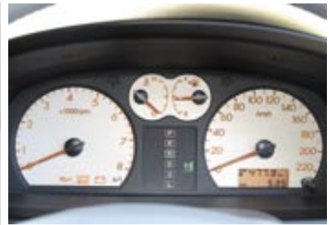
Instrumentation on the dashboard is clear and easy to read both during the day and at night.

For me an automatic transmission is the only way to go 4x4ing and this again came to the fore as we eased up one particularly steep sand track scattered with shale outcrops. With an automatic there is the advantage of not having to slip the clutch when anticipating the caravan's wheels having to climb over high obstacles, and with just enough engine revs. the combination seemed to become one unit which, at an easy speed had oodles of traction and climbed steadily over boulders. The coil spring